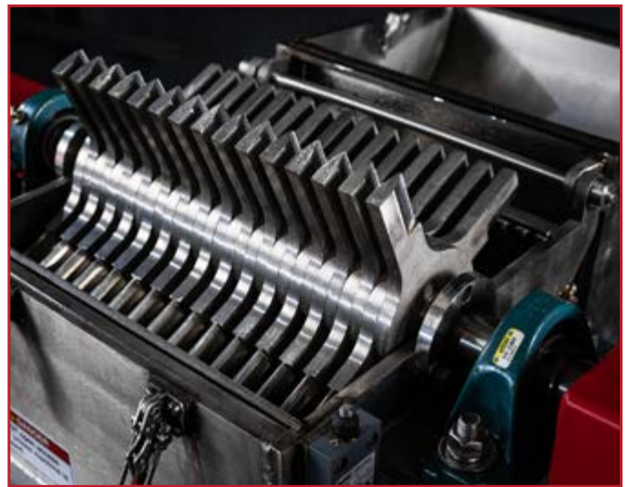
Mill top hinges opens for easy maintenance