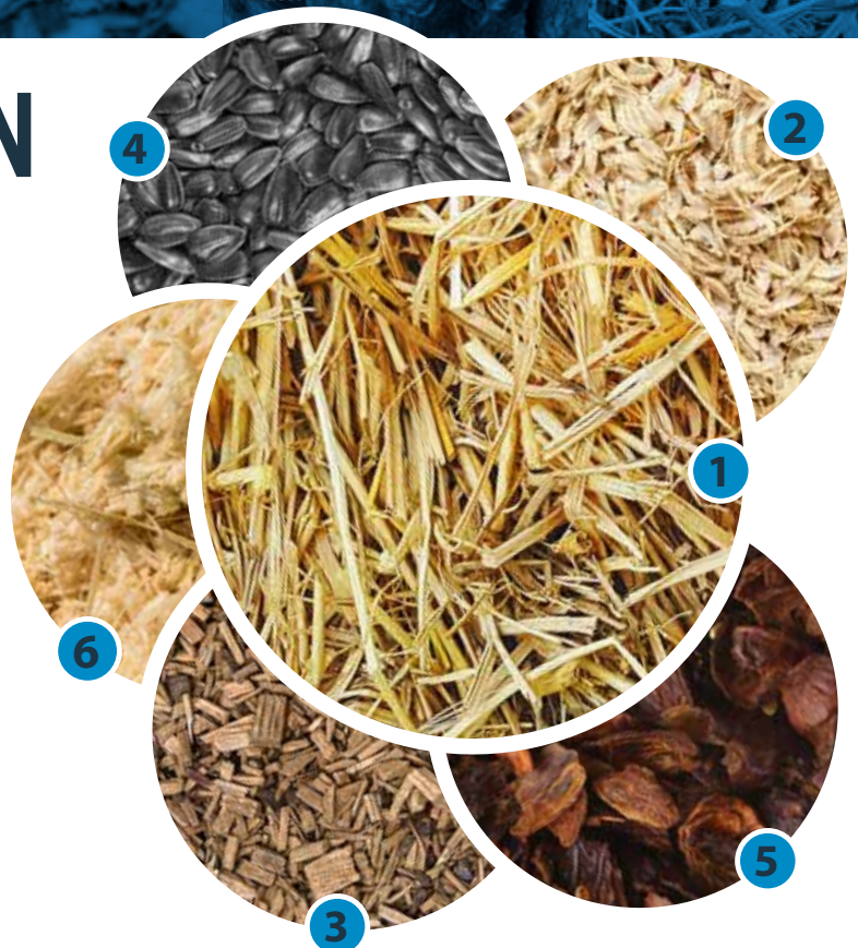
1. Straw 2. Rice Paddy 3. Wood Chips 4. Sunflower Peel 5. Coffee Husk 6. Bagasse

We carry out our productions meticulously in line with the needs of our customers with sustainable, innovative and environment friendly technologies towards Biomass industry