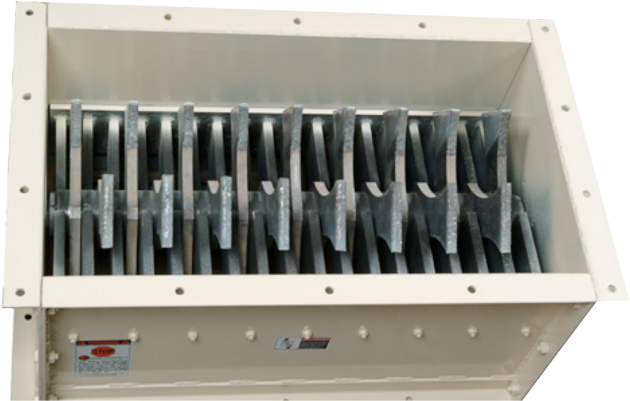
BD Series Lump Breaker featuring optional tungsten carbide coated hammers for processing abrasive materials

High capacity, single rotor, hammer and comb design, ideal for most de-agglomeration applications. Ranging in sizes from laboratory scale to heavy duty industrial, and in carbon steel, stainless steel or food grade stainless steel, the BD Series Lump Breaker is available with standard or customized hammer and comb design, tailored to maximize efficiency for individual applications. Various rotor speeds are available to optimize performance on a variety of materials reducing dry and/or hardened agglomerates to a flowable end product.