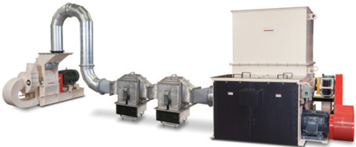
Model MP-13 Pallet Grinding System: Increase throughput up to 300% with the addition of finish grinding hammermill.