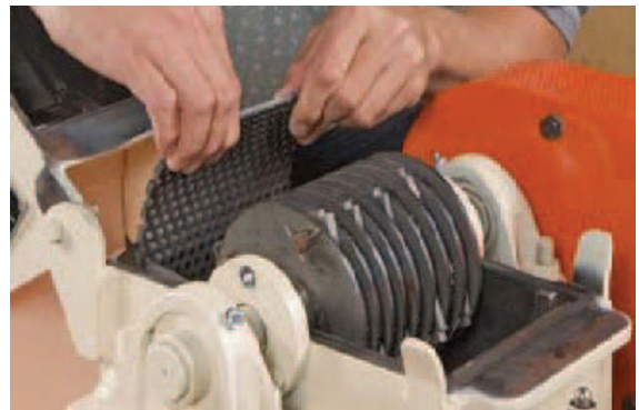
Mill top hinges open for easy screen change and mill maintenance