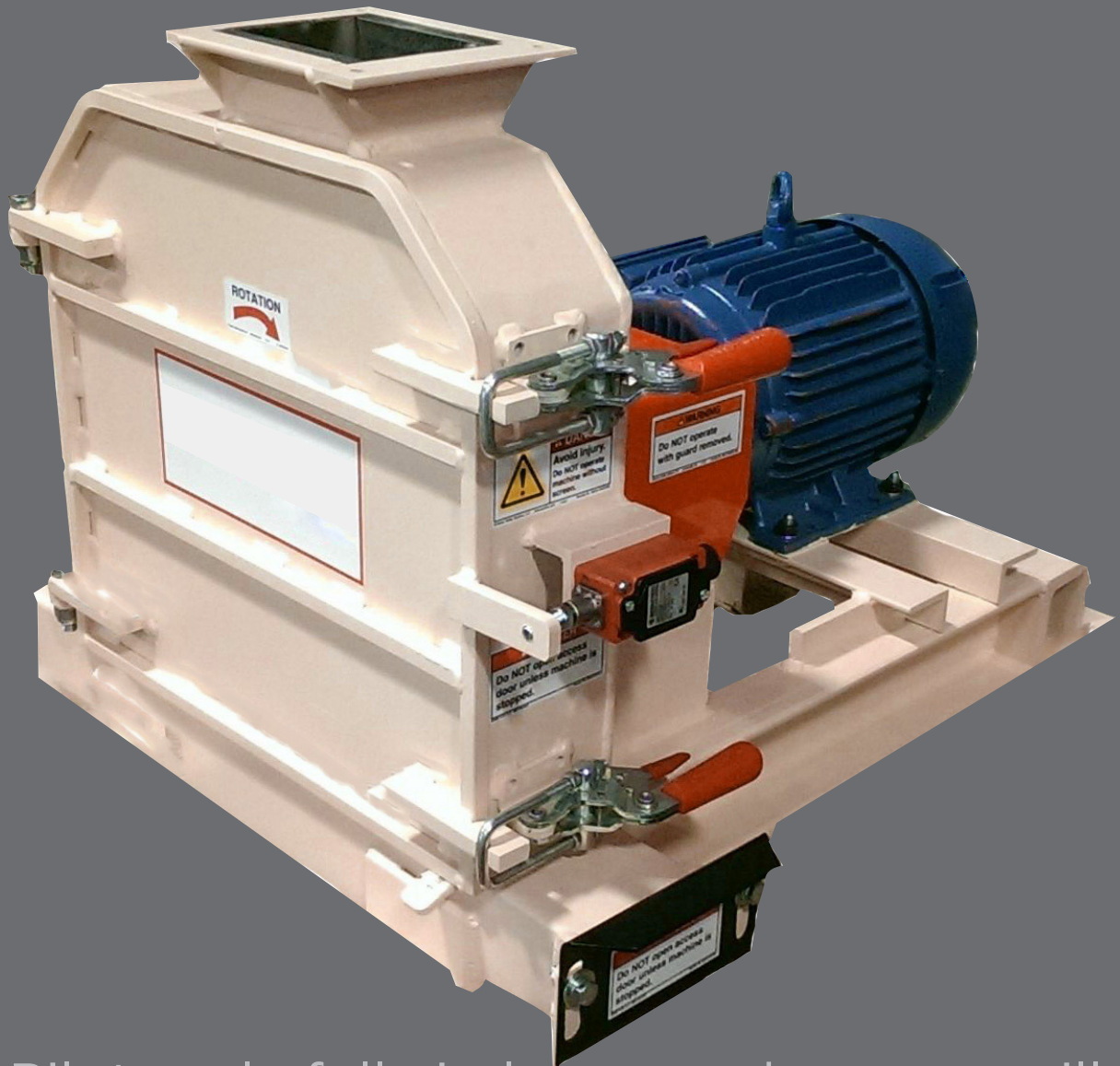
Pilot scale full circle screen hammer mill