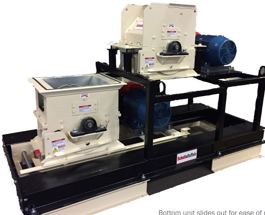
Bottom unit slides out for ease of maintenance