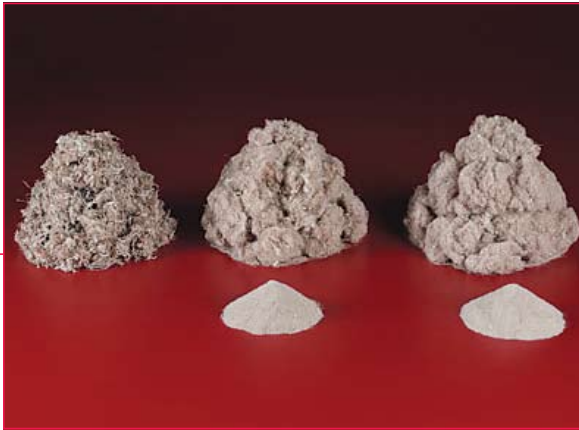
No machine produces a cleaner fiber than the "Liberator."

Carpet is not free flowing and therefore requires unique handling. The proven, time-tested technology built into every "Liberator" will allow you to achieve the highest degree of fiber-backing liberation.